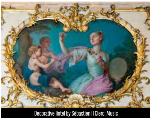
Decorative lintel by Sébastien Il Clerc: Music