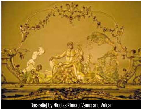
Bas-relief by Nicolas Pineau: Venus and Vulcan

When both customer operations and staff numbers increased, the bank was able to buy in 1875 the adjacent townhouse at number 5, designed by Ange-Jacques Gabriel, the architect of the palaces lining Place de La