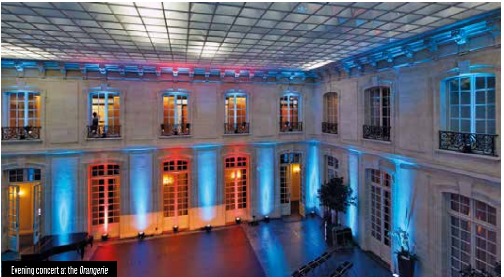
Evening concert at the Orangerie

The townhouse, standing at 3 rue d'Antin , is named "Mondragon" after the last individual owner, whereas the magnificent setting dubs BNP Paribas "the bank of Rue d'Antin". Yet a flagship conjoining both grand houses, family and bank, this landmark played host to some of the most leading figures in French social, economic and political history through centuries. Even though the 1926 National Heritage listing of the iconic façades, salons and monumental entrance door by the General Management, obliged the successive refurbishment works, these original features drenched in history were carefully preserved since 1869, when the bank first set foot in the premises.