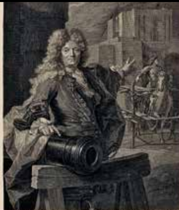
Jean Balthazar Keller and his temporary workshop where he cast the statue of Louis XIV

After buying the Lacour-Deschiens mansion in 1713 , the Duke of Antin, seeking a more convenient access, had a road opened up across these fields. Soon, the new street, that still bears his name today, was lined with numerous townhouses and further developments turned the neighborhood into a busy area . The residence at number 3 was erected between 1715 and 1725 by the French architect Jean-Baptiste Leroux (1677-1746) for Étienne Bourgeois de Boynes , Member of Parliament and Treasurer of the Royal Bank founded in 1716 by