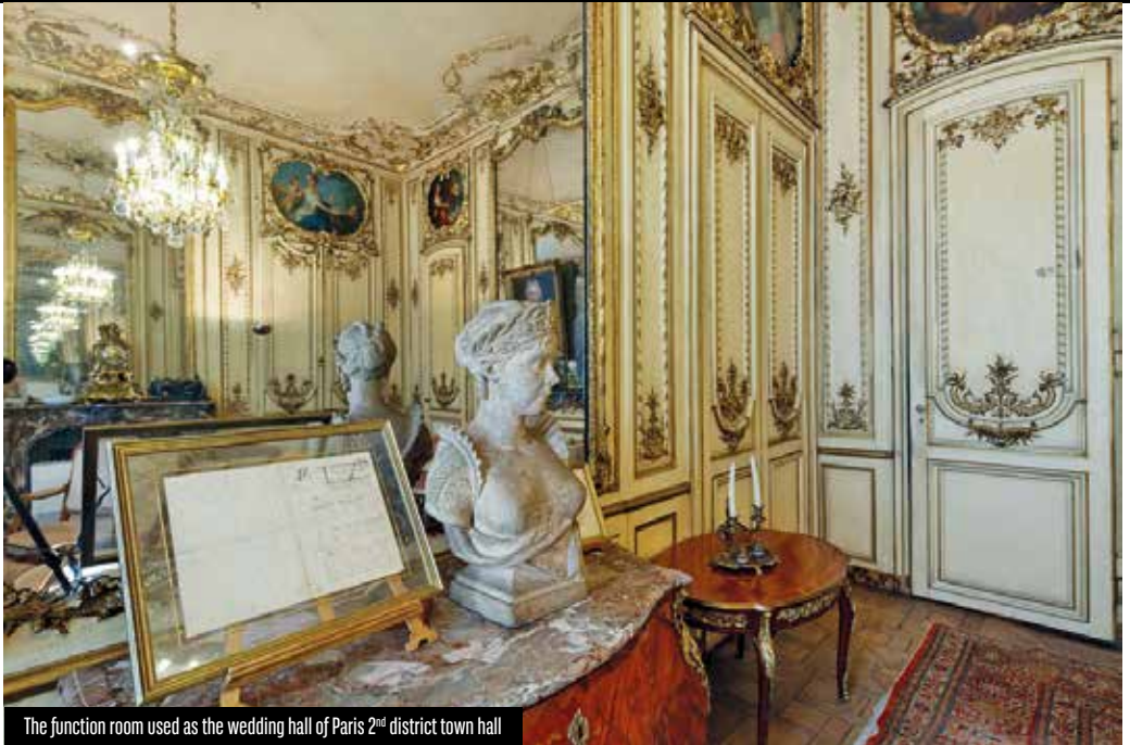
The function room used as the wedding hall of Paris 2 nd district town hall