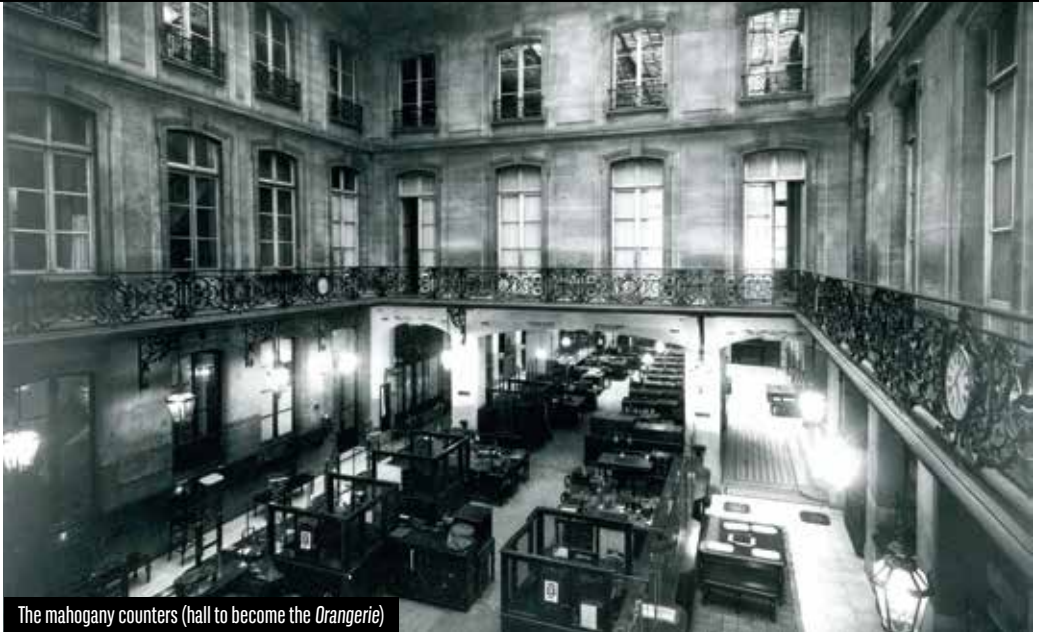
The mahogany counters (hall to become the Orangerie )

Concorde in the heart of Paris. Hence its coat of arms, joining the crests of the City and Paris and the kingdom of the Netherlands ( Pays-Bas ), adorns the façade and the main entrance door. Furthermore by 1914, the bank encompassed the whole “Antin block” delimited by avenue de l’Opéra, rue Louis-le-Grand, rue Danièle-Casanova and rue d’Antin .